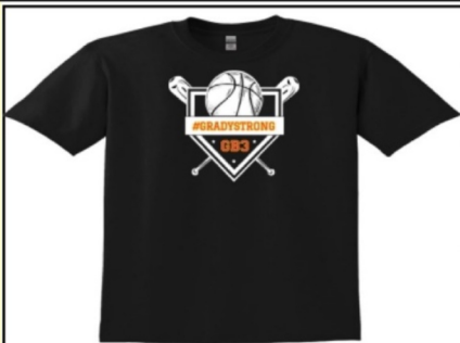
50/50 Blend Short Sleeve Tee