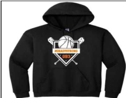
50/50 Blend Hoodie