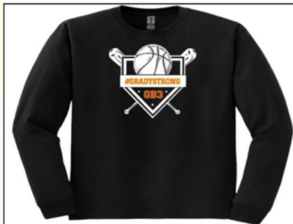
50/50 Blend Long Sleeve Tee